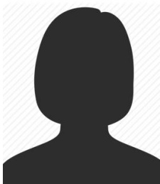
Nupur Srivastava - Box Top Coordinator